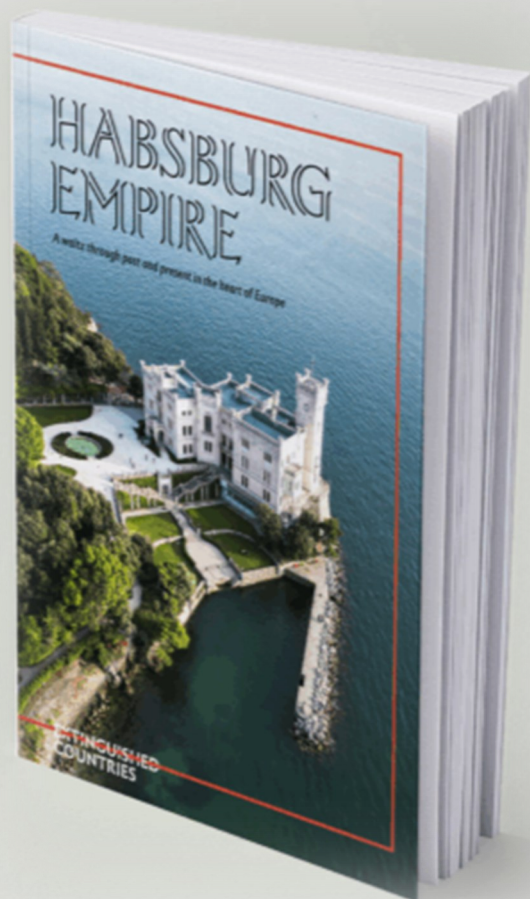
The second guidebook — the Habsburg Empire: a former country that ruled for centuries over a big part of Central and Eastern Europe

Faculty of Humanities and Social Sciences in Rijeka, Sveučilišna avenija 4 Tuesday, 9 December 2025, from 15:00 to 16:00, classroom F - 204